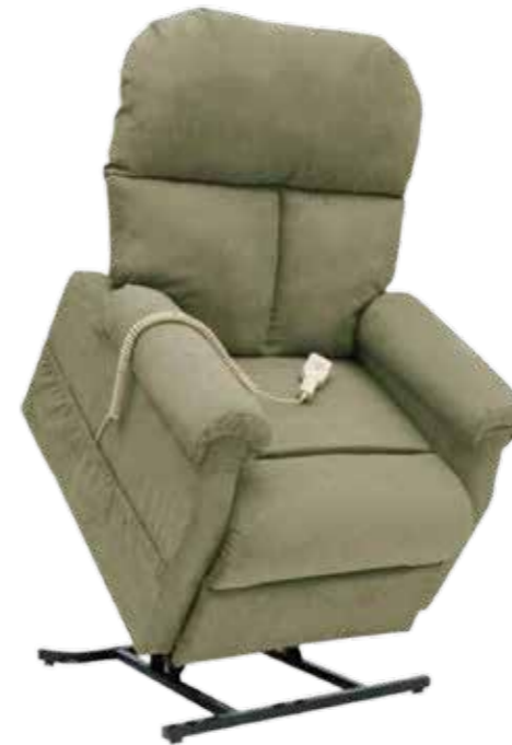
LC-101 T-back Design Shown in Sandal