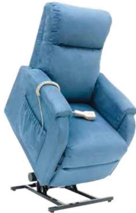
C1 Dual Pillow-back Design Shown in Arctic Blue