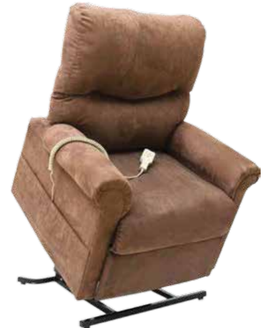
LC-107 Sewn Pillow-back Design Shown in Cocoa